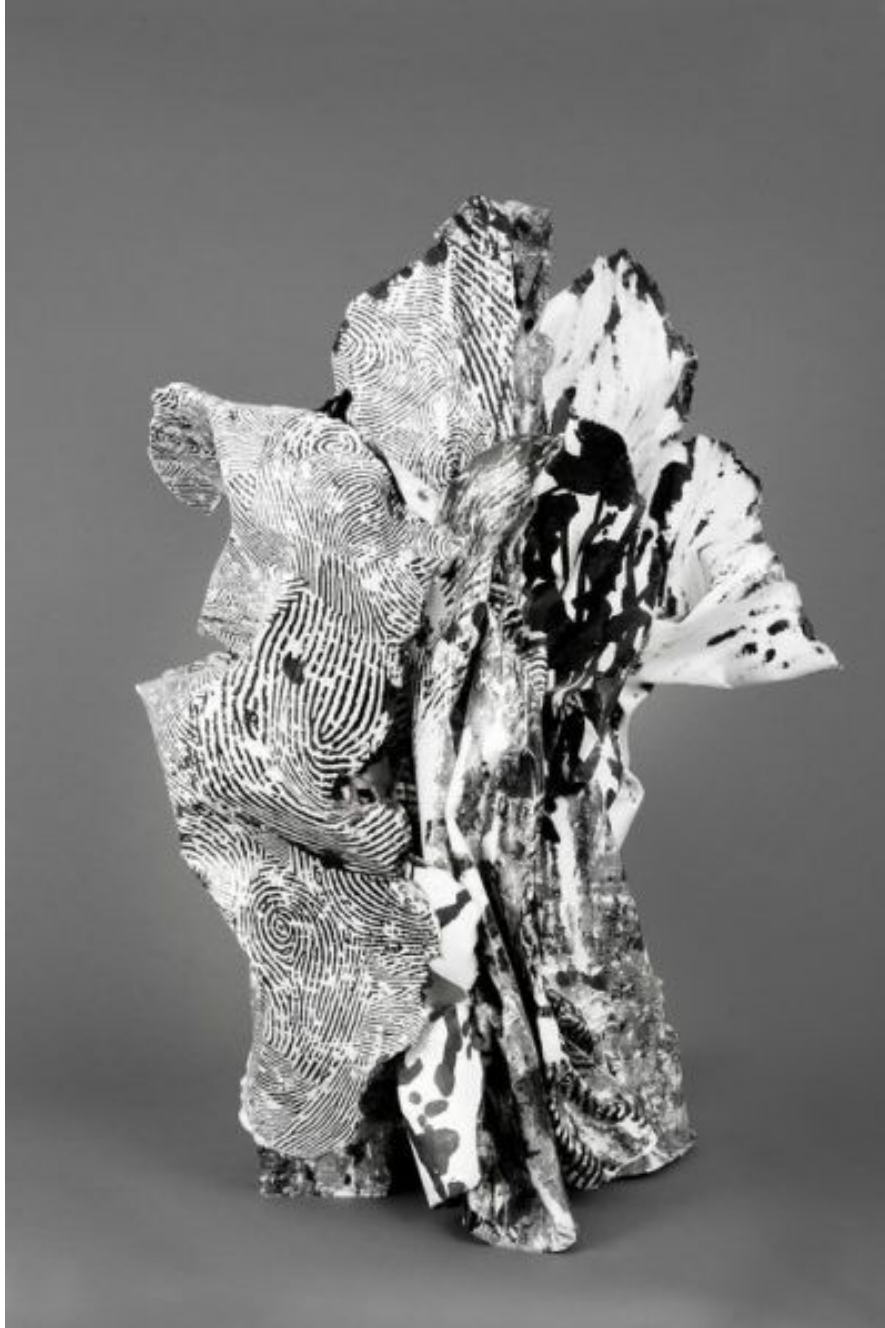
Hilda Shen, RockStrata, 2003. Paper, Ink, wax, wood, 14 x 18 x 25 inches ©Hilda Shen, courtesy Fou Gallery