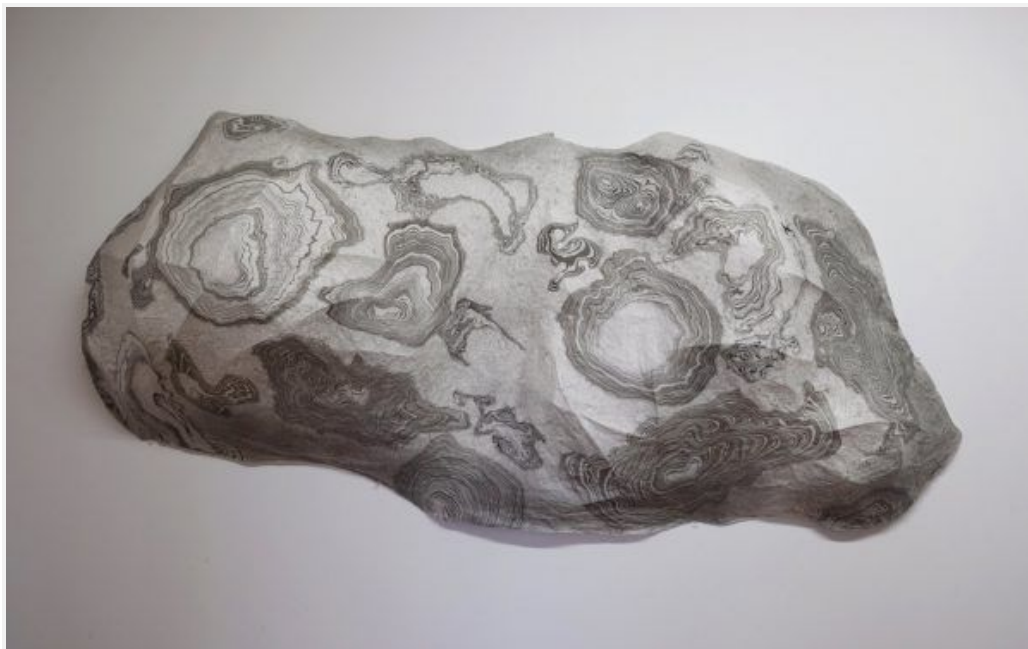
Jisook Kim, Built Emotions, 2017. Wire, ink on Hanji paper, 90 x 38 x 13 inches

Trained as a sculptor in its traditional sense in South Korea and experienced with wood, Jisook Kim offered a new shift in her oeuvre after her relocation to the U.S. and began to explore the potentials of lighter materials with more flexibility. Her recent body of work built with Hanji paper and steel wire orchestrate the entanglement of hypnagogic fine lines in an almost onomatopoeic manner, coating the pale skin of those monumental yet lightweight structures with condensed topographic patterns. The viewer can almost hear them whispering in the static serenity of the mountains, from which something mighty would emerge and announce its omnipresence.