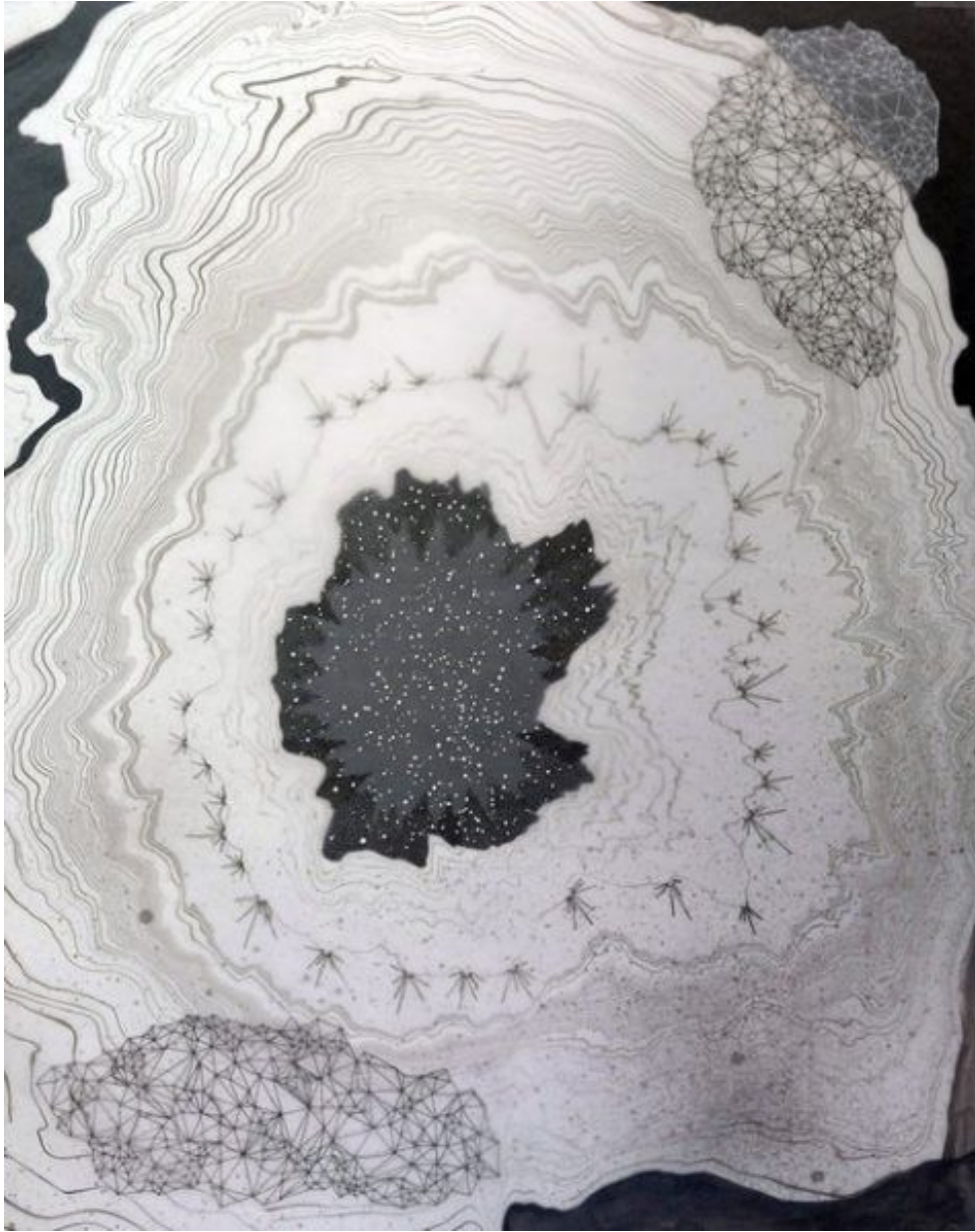
Jisook Kim, Memory of Emotions, 2017. Ink, pencil, acrylic on paper, 19 x 24 inches ©Jisook Kim, courtesy Fou Gallery