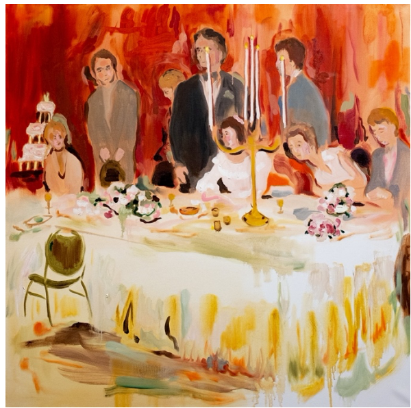
The Wedding Party, 2021. Oil and acrylic on canvas, 36 x 36 inches ©Cathleen Clarke, courtesy of Fou Gallery and The Honey Pump

All the People From Your Past and The Wedding Party are two representative examples of Clarke's depiction of crowded occasions and people's facial expressions in her typical style. In the green toned work All the People From Your Past, the blurred details of people's faces don't give any obvious hint of a specific mood, but the intenseness from the colors and the composition implies surging emotions that overflow in the scene, and arouses the viewer's curiosity to explore more behind the scene.