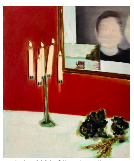
The Place on Shannon Lake, 2021. Oil and acrylic on canvas, 20 x 24 inches ©Cathleen Clarke, courtesy of Fou Gallery and The Honey Pump

In the red toned work The Wedding Party , the similar painting technique is applied to the image, and makes the atmosphere of this lively moment distant and hazy, as if separated by a layer of woolen glass. The intentionally missing details and the slightly distorted lines resemble the impression in mind when trying to recall a recollection from a long time ago.