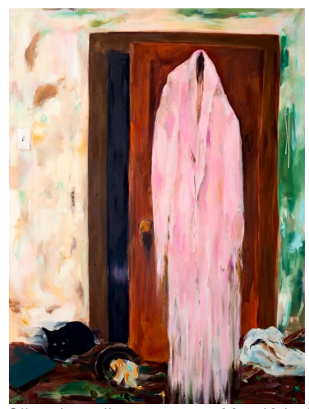
There Was a Door Shutting, 2021. Oil and acrylic on canvas, 36 x 48 inches ©Cathleen Clarke, courtesy of Fou Gallery and The Honey Pump

In another painting, The Place on Shannon Lake , the subject of the image is a corner of a room and a burning candle on a table. The figure in the frame has begun to blur like a vanished memory, while the place of childhood memories in the photograph sandwiched between the edges of the frame is remarkably clear. The contrast between this clarity and blurring in the same image is also an interesting aspect of Clarke's painting: the outline of memory is never continuous and sharp. It stays in fragments that are sometimes explicit and sometimes obscure. When looking back at the past, our memory is as intriguing as another world.