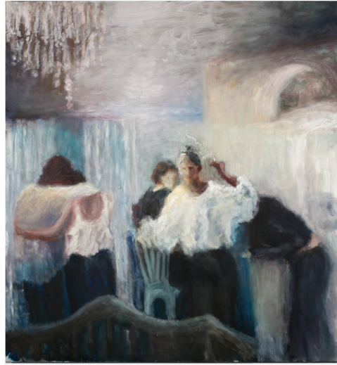
Helia Chitsazan, After Midnight , 2022. Oil on canvas, 54 x 56.7 inches

Chitsazan's artistry lies in her ability to capture intimate and sincere moments of life that are often hidden from the public eye. Many of her pieces are inspired by fond memories of her time spent with family in Tehran, and they feature vivid and thick colors that illuminate dimly lit indoor spaces. These spaces often house one or more figures who are caught in deep thought or active conversation. Viewers of her art can easily sense the tense energy that permeates her work, which is generated through the bold body language of her subjects, the unspoken thoughts that are hidden under their expressions, and the play of light and shadow that creates an aura of uncertainty. Chitsazan is an artist who defies classification; although her work displays traces of both Neoclassicism and Romanticism, her unique artistic style is characterized by a distinctly innovative approach to spatial relationships, brushwork, and surface textures.